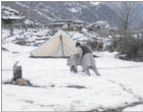
A Man Carting Water to His Temporary Home in Bana, Allai Valley.

true in Indonesia after the tsunami, and polls have shown that U.S. assistance improved Indonesians' opinions about the United States. 4 Many observers would consider continued contributions by the U.S. government to recovery efforts in Pakistan an appropriate demonstration of solidarity with an ally that has provided highly valued assistance in the search for Al Qaeda.